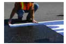
Fig. 6 Position PreMark® material according to diagram provided.