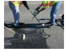
Fig. 5 Squeeze out sealer and spread with roller.