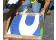
Fig. 1 Handle sheets with plastic

Note: When applying a very large marking, such as an interstate shield or bike lane with multiple material sections, leave the 8 inches closest to the continuation edge unheated. Repeat steps 1 through 5 within 50 sq. ft. sections at a time until entire application area is complete. Do not expose uncovered areas of applied sealer to the flame of the torch, as this will cause the sealer to cure prematurely.