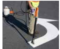
Fig. 3 Heat PreMark® material according to instructions.