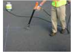
Fig. 1 Prepare area by removing debris with blower then remove moisture with heat torch