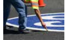
Fig. 2 Position marking to draw outline of application area