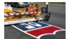
OPTIONAL: If using a large infrared heater, contact your Ennis-Flint representative for more information.