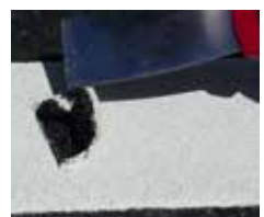
Fig. 4 Perform chisel test to verify bond. Evidence, as shown, of asphalt aggregate bonded to the underside of the lifted material indicates good adhesion.