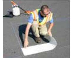
Fig. 2 Position PreMark® material according to diagram provided