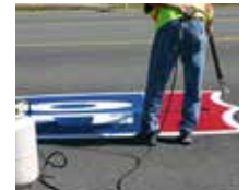
Fig. 7 Heat PreMark material