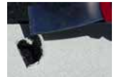
Fig. 8 Perform chisel test to verify bond. Evidence of aggregate bonded to the underside of the lifted material indicates good adhesion.