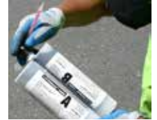
Fig. 4 Prepare sealer cartridges for use in sealer gun.