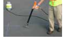
Fig. 3 After moving material aside, remove moisture from substrate