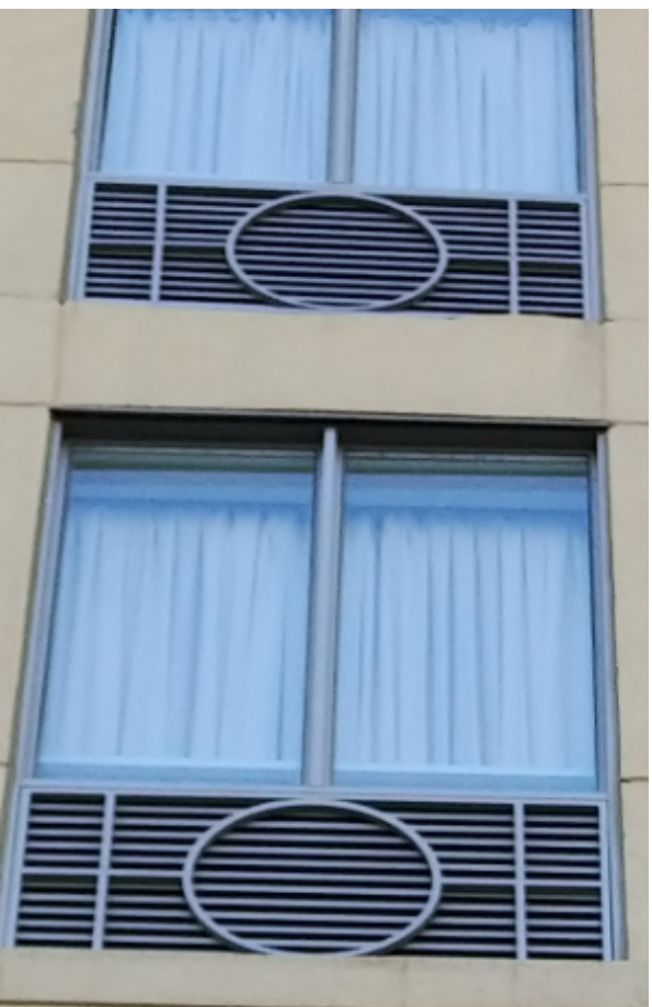
DECORATIVE LOUVER (FOR PTACS UNDER WINDOWS)